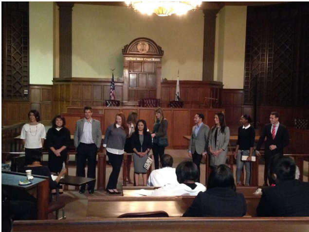
Volunteers take a bow after a wonderful evening